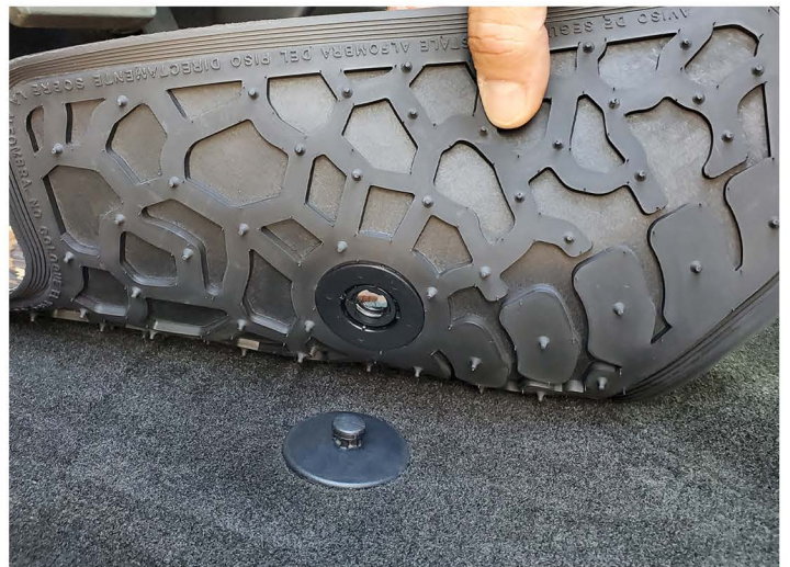
Line up the button(s) of your FLEXTREAD™ mat with the post(s)