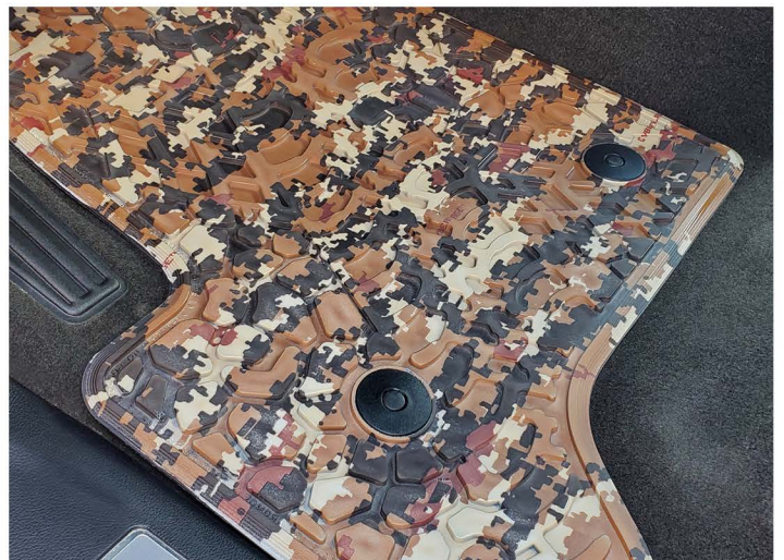
The fully installed mat