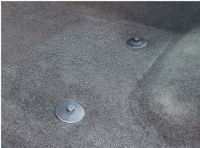
Remove old mats to expose you vehicle's safety positioning post(s)

See the corresponding images for the proper fastening of your factory floorpan fit mats.